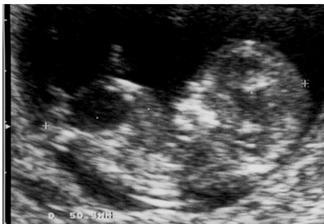
Figure 1 A 12-week fetus with megacystis.

A computer search of the database was made to identify all singleton pregnancies with fetal megacystis at the 10–14-week scan. The prevalence of chromosomal abnormalities and pregnancy outcome were examined in relation to the longitudinal diameter of the fetal bladder.